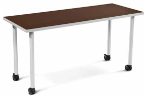
POST LEG Sturdy and affordable (glides or casters)