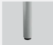
POST LEG GLIDE