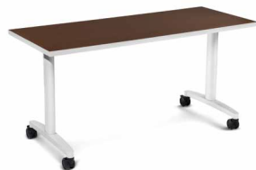
T-LEG Unobstructed leg room (glides or casters)