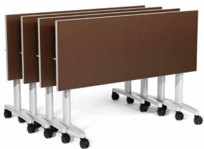
NESTING BASE Space-efficient storage (casters only)