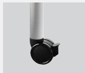
POST LEG CASTER Available on 24" and 30" D tables only.