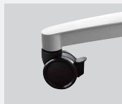
NESTING BASE/ T-LEG CASTER