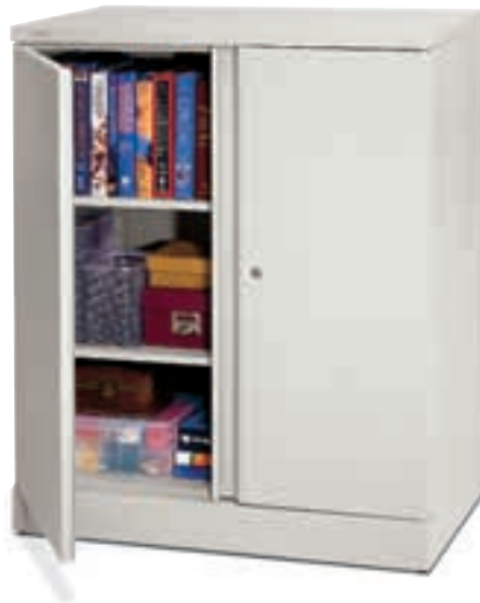
Easy-to-Assemble Storage Cabinet

Secure, lockable storage cabinets are ideal for all of your supplies and equipment. Reinforced doors and straightforward styling make it the storage solution for diverse applications. Choose from assembled or non-assembled models.