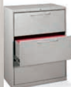
Flagship Lateral File