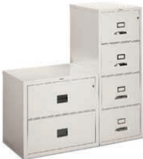
FlameSafe Lateral and Vertical Files

Your most valuable documents are safe in these asbestos-free files. Rated to 1700° F external temperature for up to one hour, these robust units can also withstand a 30-foot fall. Available in vertical and lateral styles.