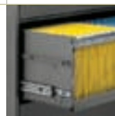
Roll-out shelf with receding door provides easy access to contents.