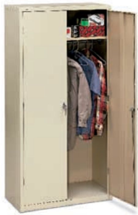
Pre-Assembled Storage Cabinet