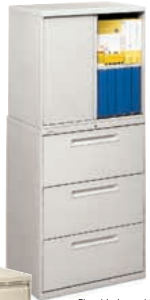
Flagship Lateral File with Overfile