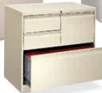
Efficiencies File Center