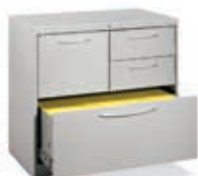
Flagship File Center

Flagship storage solutions give you premier, top-of-the-line storage choices that make the most of your workspace. Flagship lateral files, pedestals, file centers and storage towers will fill your specific storage needs. Customize paint to match your current furnishings, or start from scratch and find your own storage style. With Flagship®, all you have to do is choose.