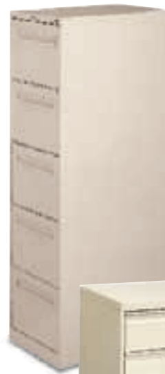
470 Series Vertical File