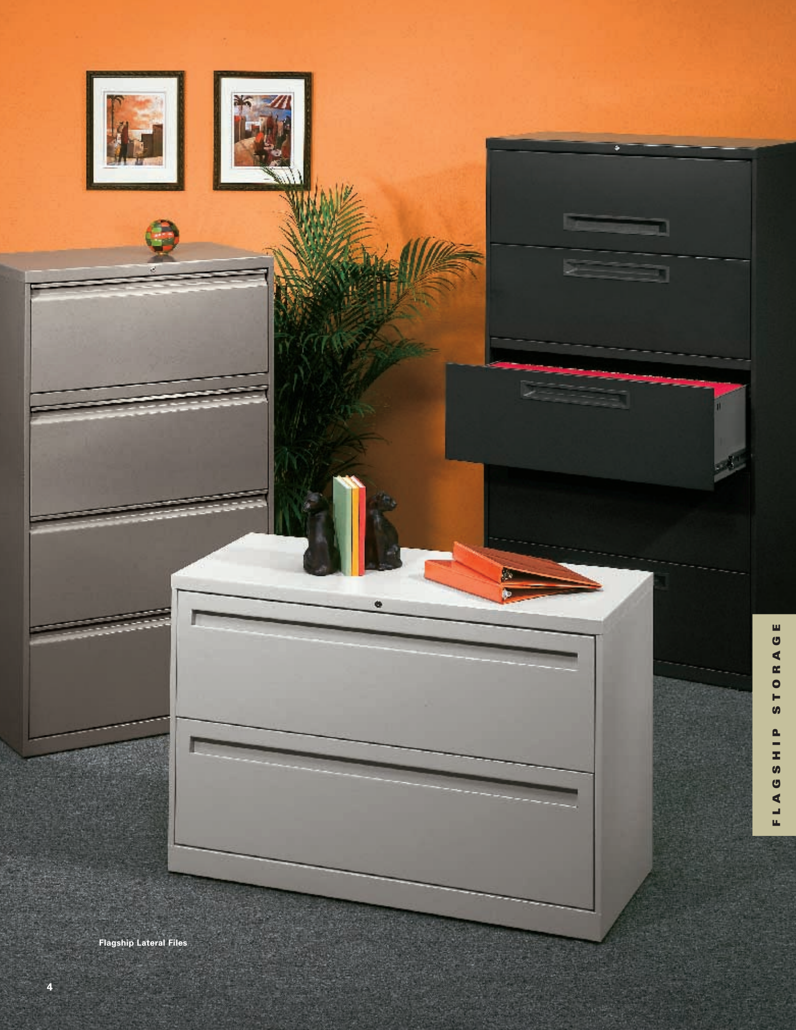
Flagship Lateral Files