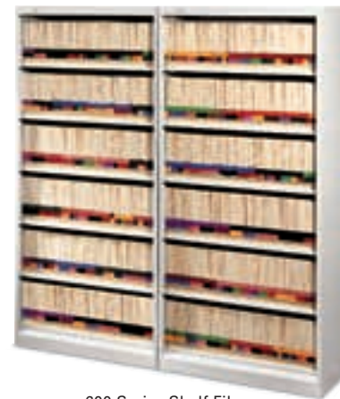
600 Series Shelf Files

More filing. Less space. Hard to believe? Efficiencies makes it a reality. Ideal when constant retrieval, high volume filing is necessary. Units glide on stainless steel track with precision ball-bearing wheels. Use with 600 Series shelf files. Available with open shelves or receding doors.