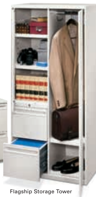
Flagship Storage Tower